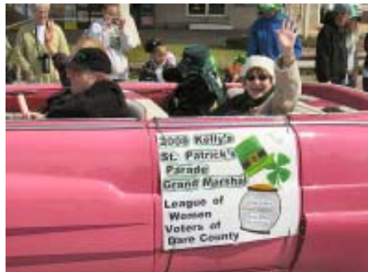
Some of the LWV Dare County Members Serving as Grand Marshalls